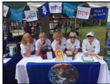
World Citizen Board Members man the booth at the Re-dedication of Concordia Language Village in Bemidji, MN, Aug. 2015.